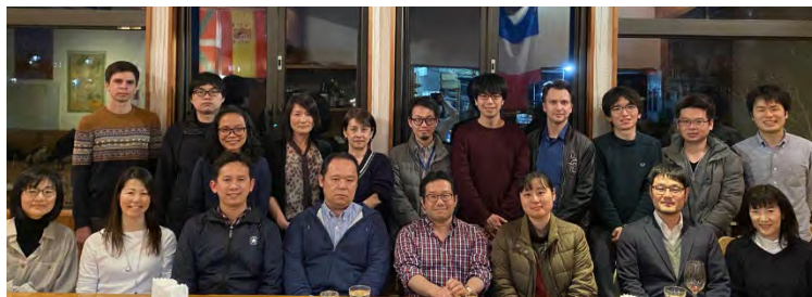
RIKEN Cluster for Pioneering Research