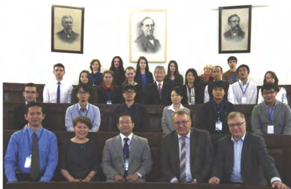
RIKEN/Kazan (Russia) Joint Laboratory