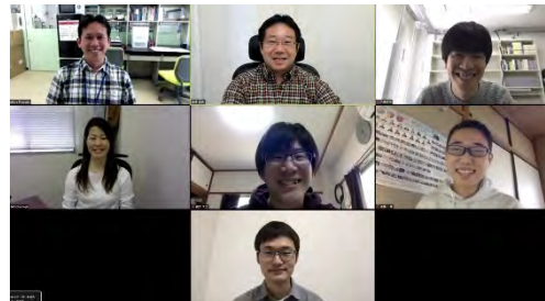
Tokyo Institute of Technology