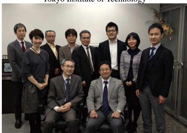
RIKEN Baton Zone program (GlycoTargeting Research Group)