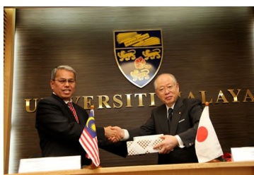
Left: Signing ceremony at University Malaya

September 23, 2011_ RIKEN and University Malaya (UM) had signing ceremony at UM campus. Based on this MOU, UM and RIKEN will collaborate in research in the fields of chemistry and material science and students and staff exchanges.