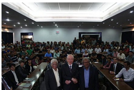
Prof. M.R.S Rao, Dr. C.N.R. Rao and President NOYORI, after the lecture in Bangalore