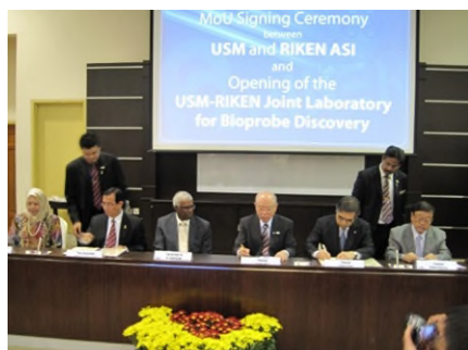
Left: Opening event for the joint laboratory

September 22, 2011_ The RIKEN Advanced Science Institute (ASI) and the Universiti Sains Malaysia (USM) held an event to commemorate the signing of a Memorandum of Understanding between RIKEN and the USM together with the opening of the USM-RIKEN Joint Laboratory for Bioprobe Discovery at the Institute of Research in Molecular Medicine, USM.